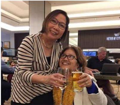
High School 1968 Golden Jubilee Core Committee Meeting