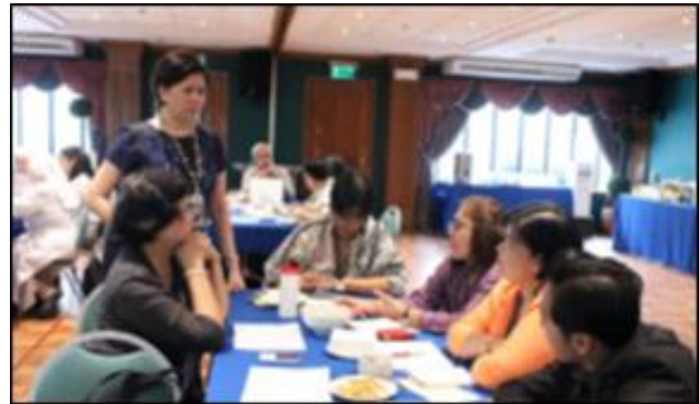
Groups discuss the applicability and relevance of SPCEM strategies.