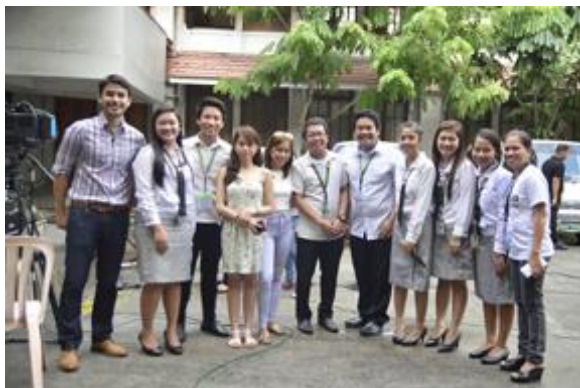
The hosts with Paulinians...