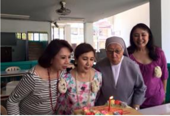
Birthday celebrants blow the candles: