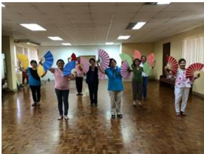
Left-the dancers with fans...

Photos show the jubilarians practicing their dance from The Phantom of the Opera .