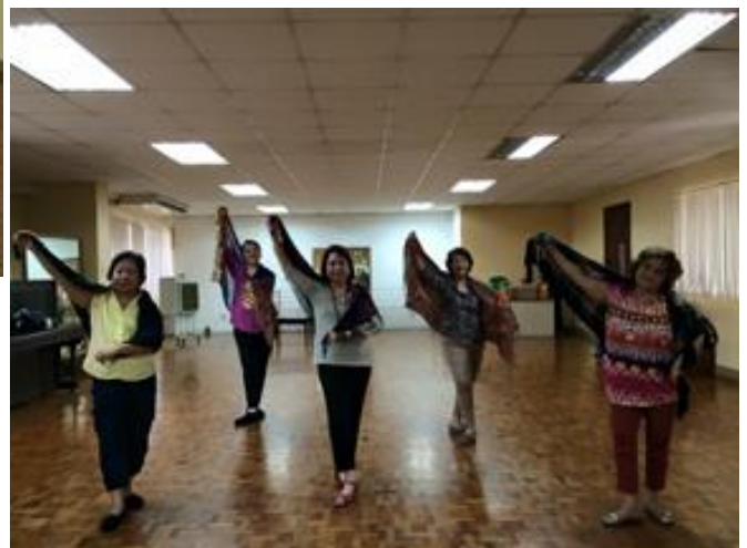
Right-the dancers with shawls