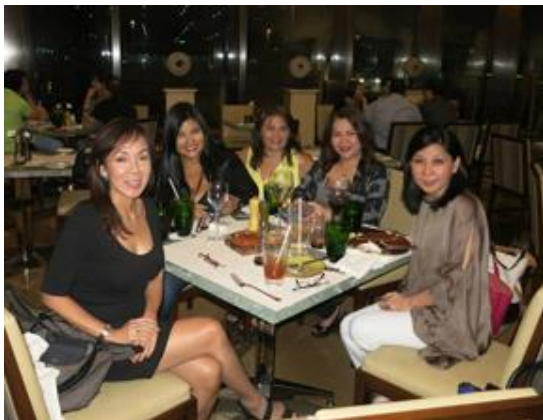
High School 1980 Tapenade, Discovery Primea Hotel Ayala Avenue, Makati City