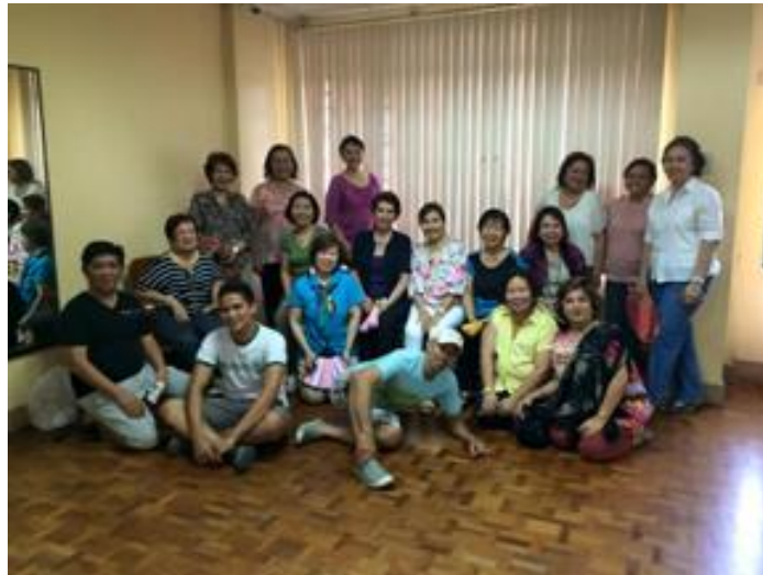
Taking a breather with their dance instructors...