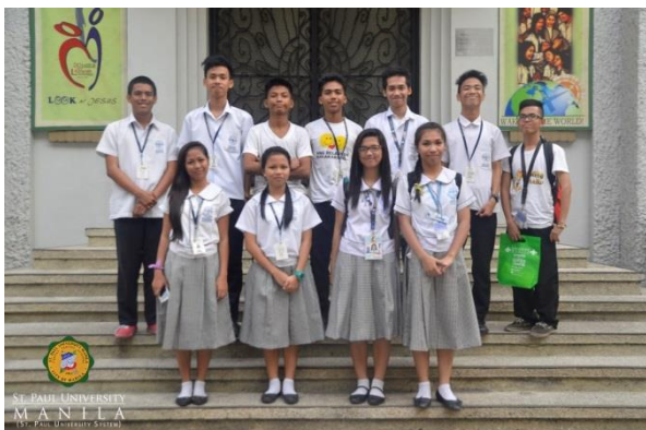
Future Paulinians from Pasay City North High School