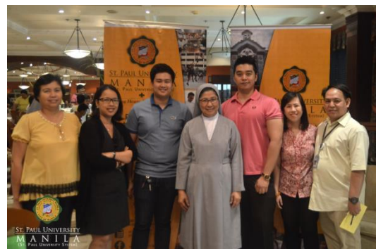
School administrators with senior high school partners