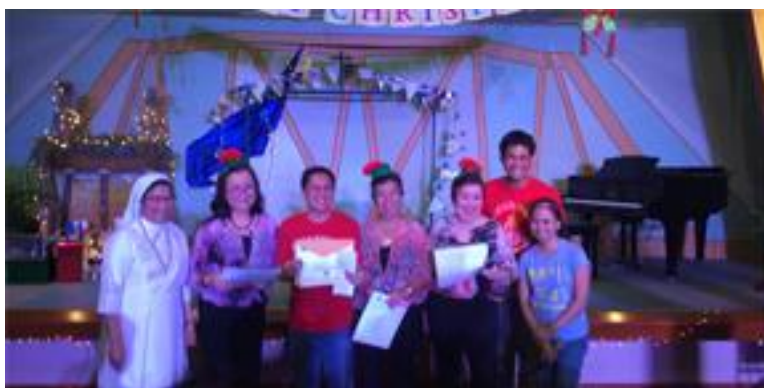
Most artistic NAPA 3