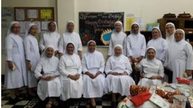
The SPC Malate Sisters at home...

Indeed, Christmas is the best time of the year, and the St. Paul Sisters here and abroad celebrated the season with joy and thanksgiving