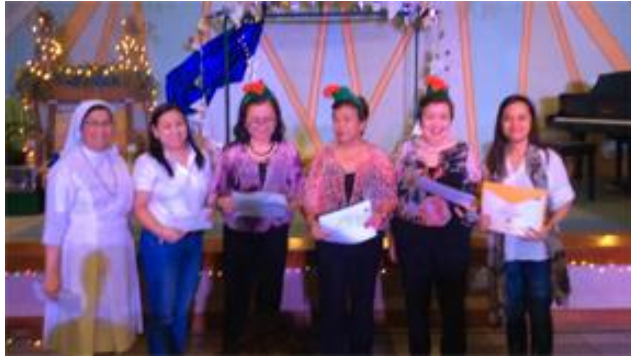
Most organized ANTS/Library/ReIEd