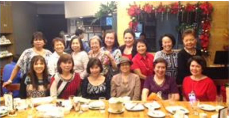
High School 1965