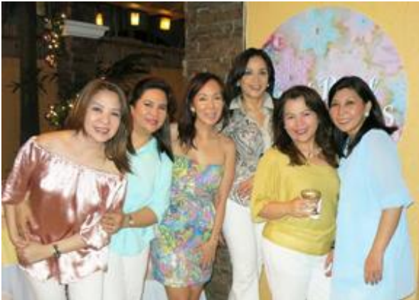
High School 1982