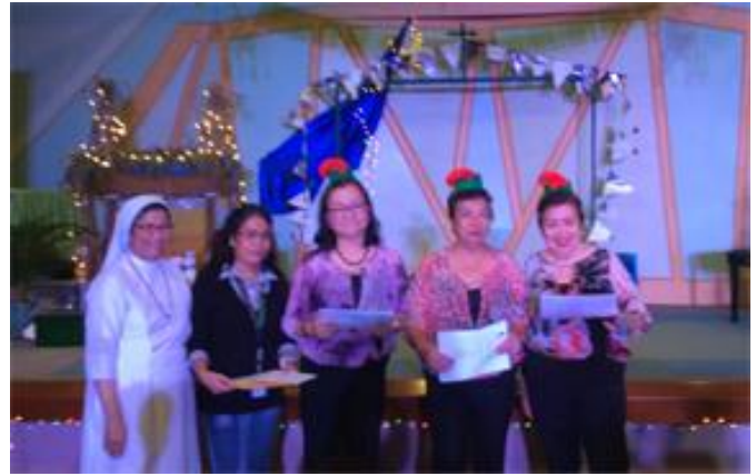
Most creative NAPA 1