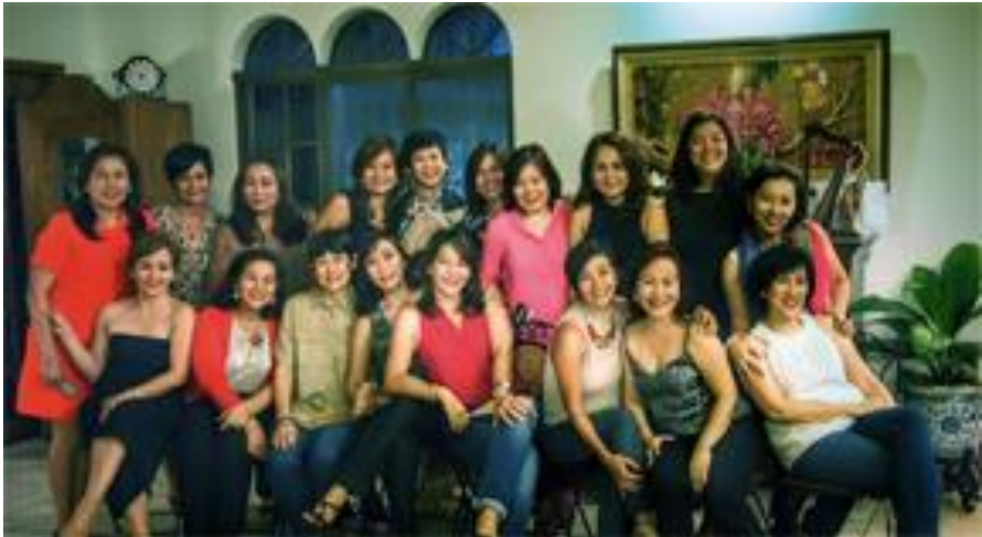
High School 1980