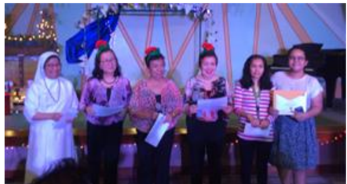
Most meaningful NAPA 2