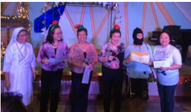
Most relevant CBM