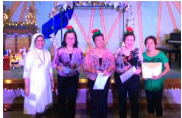
Most entertaining CASE/Senior High