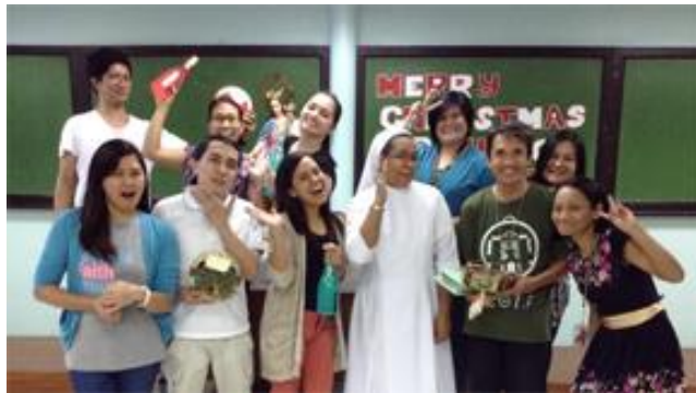
Rel. Ed./Christian Formation