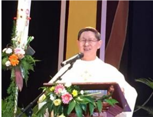
Cardinal Tagle, main celebrant, delivering his homily and posing for a souvenir photo