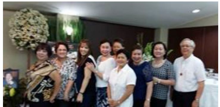
High School 1965