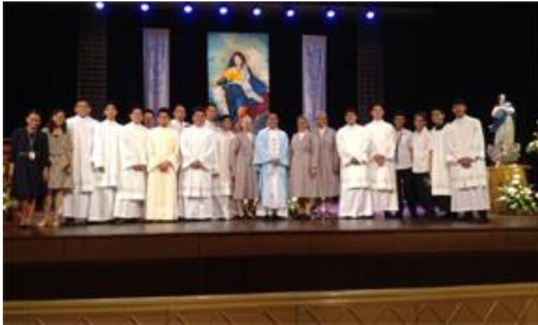
Eucharistic Celebration 8 September 2016 Fleur-de-lis Theater Acrylic painting of the BVM by Inna De La Torre