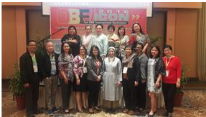
The SPU Manila delegates

The two-day session centered on how to bring the essence of OBE to life through its four power principles, namely: Clarity of Focus on outcomes of significance, Expanded Opportunity for all to succeed, High Expectations, and Designing the Curriculum down from where you want to end up. According to Dr. Spady, these four principles are the lifeblood of OBE in action, more so when they are applied consistently, creatively, systematically, and simultaneously.