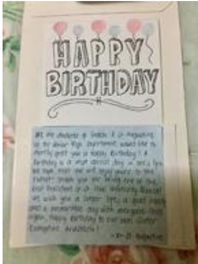
From the Senior High School students... St. Augustine