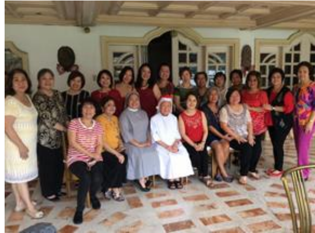
High School 1966 Pre-Christmas Party 26 November 2016 Tankiang Residence