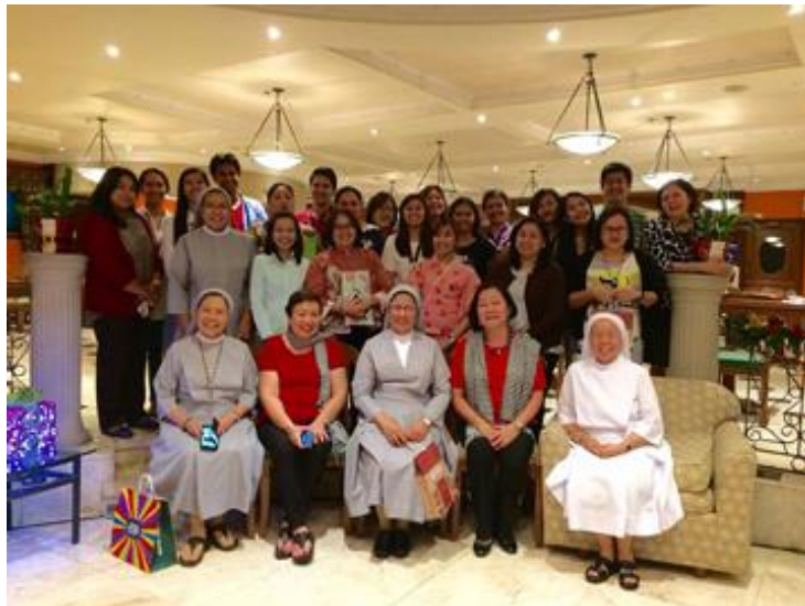
Merry smiles from everyone...