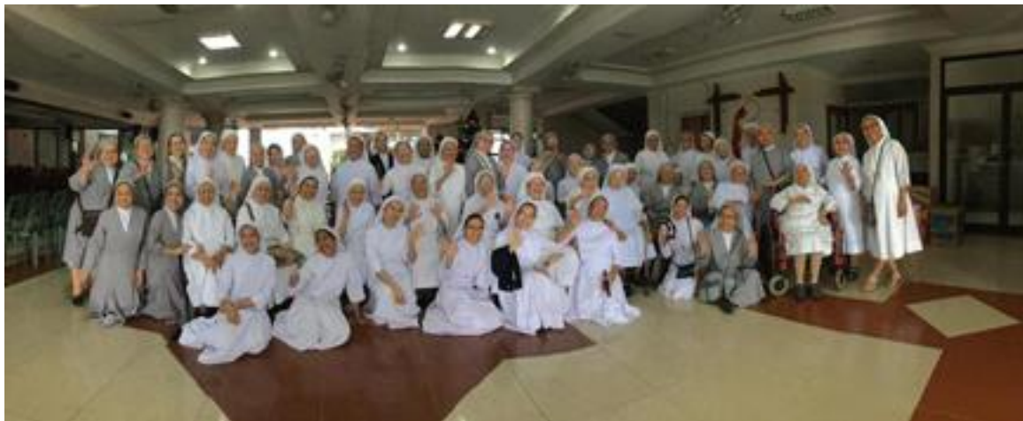
The SPC Sisters: a picture of a joyful family