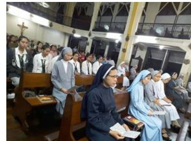
The first Misa de Gallo on 16 December...

In solidarity with the rest of Christendom, Misa de Gallo in SPU Manila started on 16 December 2016. Mass Sponsors were: 16 December: College of Nursing and Allied Health Sciences and College of Music and the Performing Arts; 17 December: College of Business and Management; 19 December: Non-Academic Personnel; 20 December: College of Arts and Science and College of Education/Senior High School; 21 December: Advent Mass, 9:00 A.M. in the Fleur-de-lis Theater.