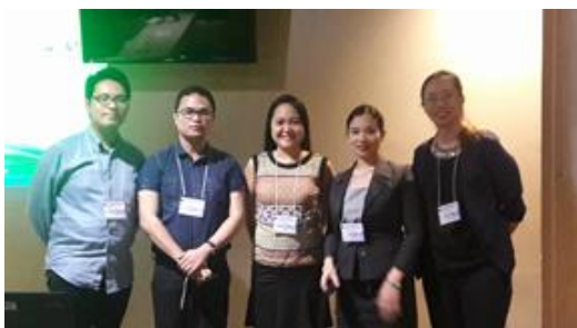
Delegates posing for souvenir photos...