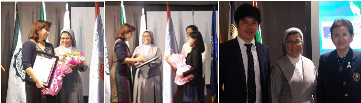
With VP Robredo...