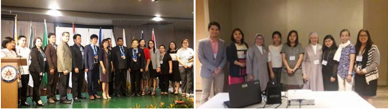
More souvenir photos...