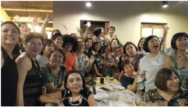
High School 1968 Rock and Roll Night