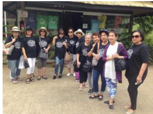
BSN 1968 Golden Jubilarians Dinner Dance Manila Hotel