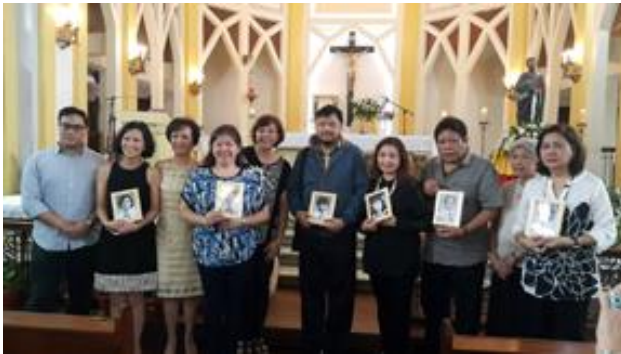
High School 1968 Golden Jubilarians Memorial Mass and Luncheon For departed classmates