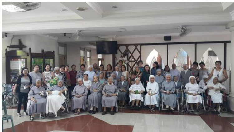
High School 1968 Visit to Vigil House