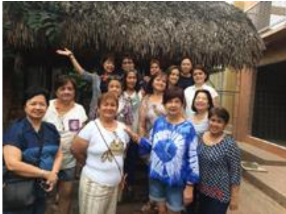
High School 1973 Outing in San Pablo and Tiaong, Quezon