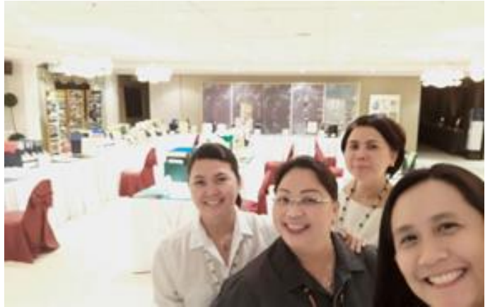
...and the SPU Manila Re-Survey Team.