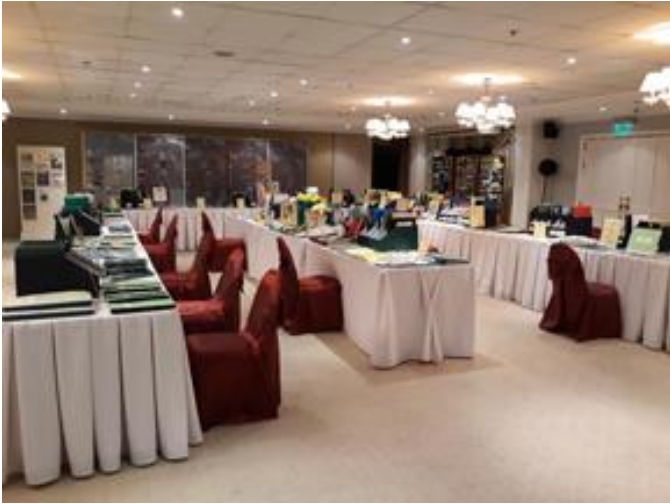
The PAASCU Team Headquarters