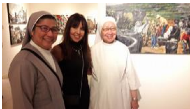
and with her classmates (GS 1968) who attended the opening of the exhibit.