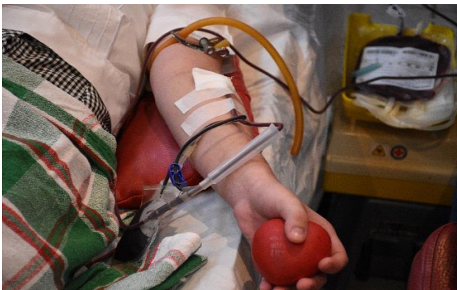
A SHS student donates blood

The recitation of the Rosary and celebration of the Holy Mass sponsored by the Finance and Administrative Services and selected SHS students were also held, respectively.