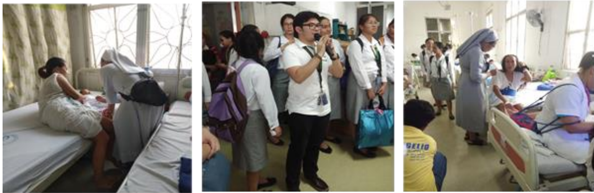
Visit & Gift-giving to Jose Fabella Memorial Hospital