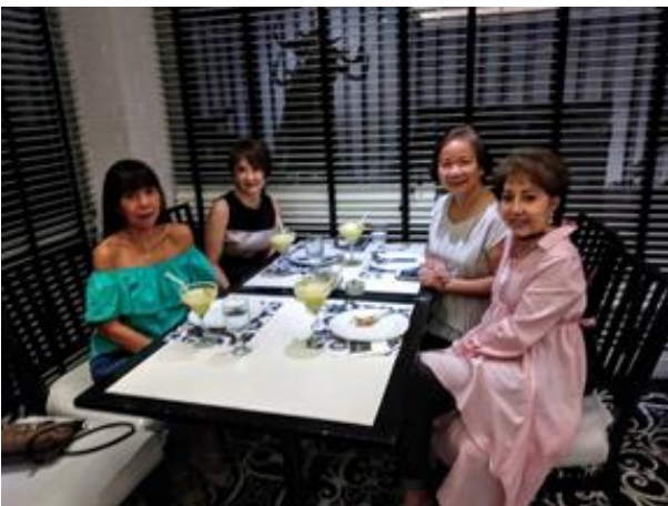
High School 1966 August Birthday Celebration