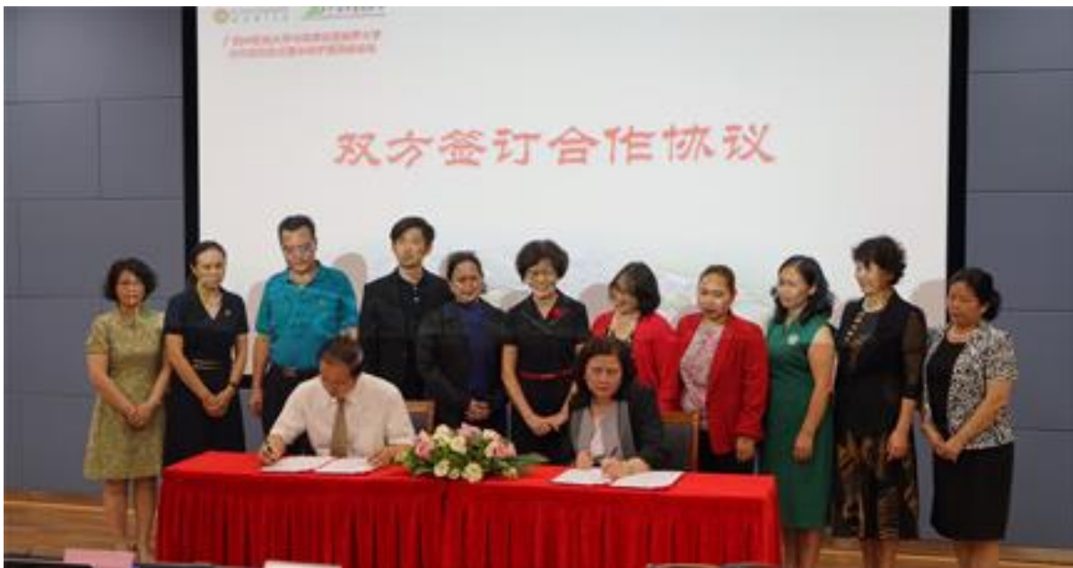
The MOU signing

This activity was in partnership with Yibu Education Technology Company Limited (YIBU).