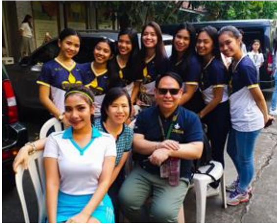
Big smiles at the opening of the FLCC 2019