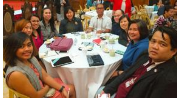
SMEC Academe Linkage Group