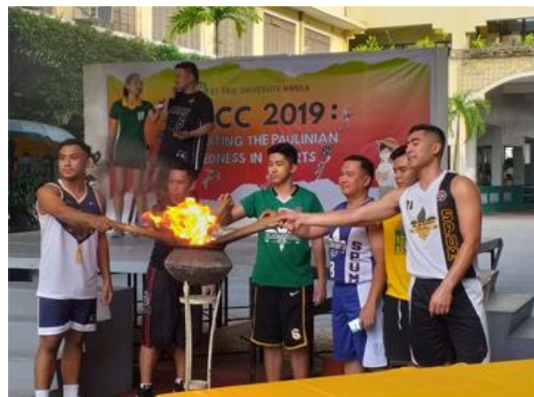
Opening of the FLCC 2019