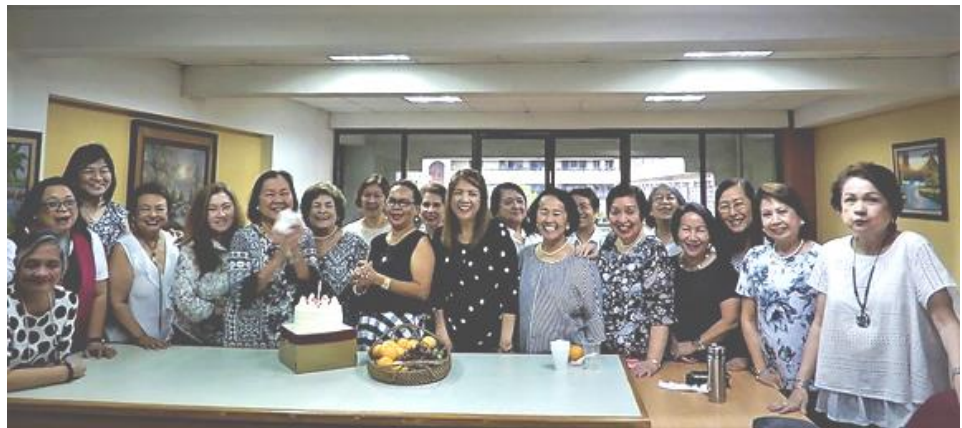
SPMAFI Meeting with 2020 Jubilarians Meeting Room HRMTC 12 November 2019