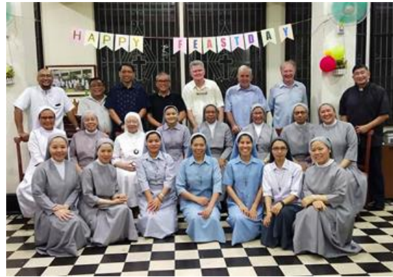
SPC Sisters and priest friends celebrate the conversion of St. Paul.