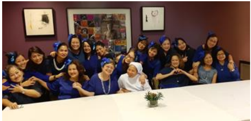
Paulinians in New York