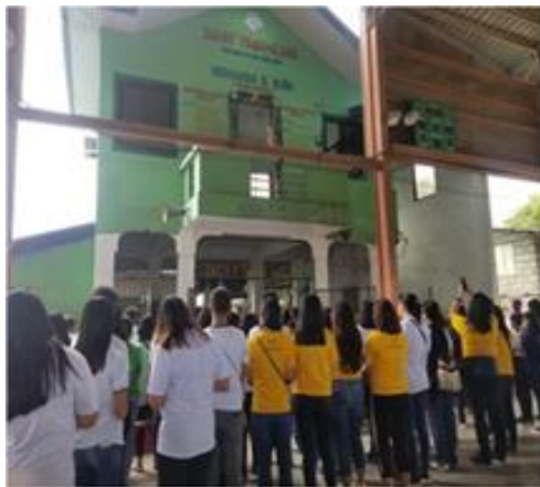
The activity started through a Eucharistic celebration

Below are some of the pictures during the actual relief operation: