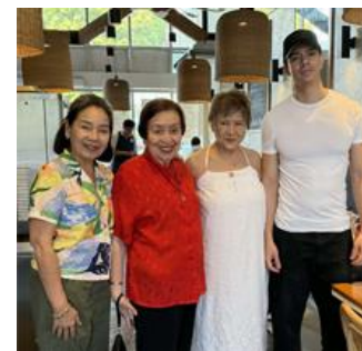
Lunch with MOM