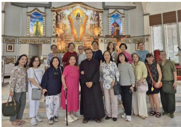
Visita Iglesia to seven Churches in Laguna - March 7, 2026