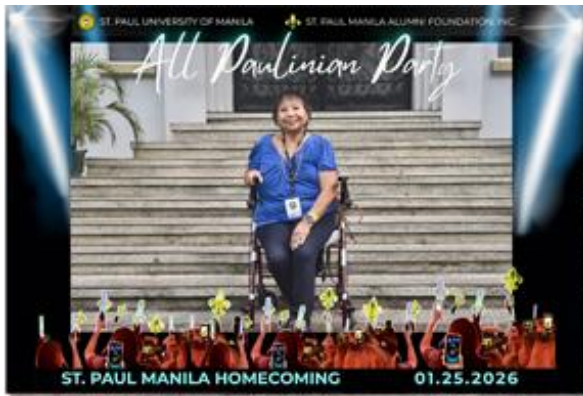
High School 1956: Titanium Jubilarian