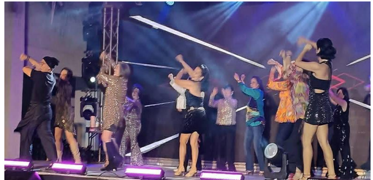
and HS 1976