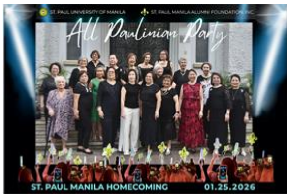
High School 1966: Diamond Jubilarian