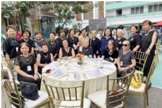
High School 1965