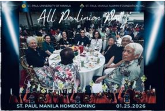
High School 1954, 1962, 1963