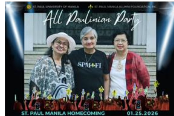
High School 1973