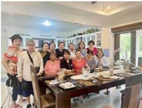
merienda in Sol's