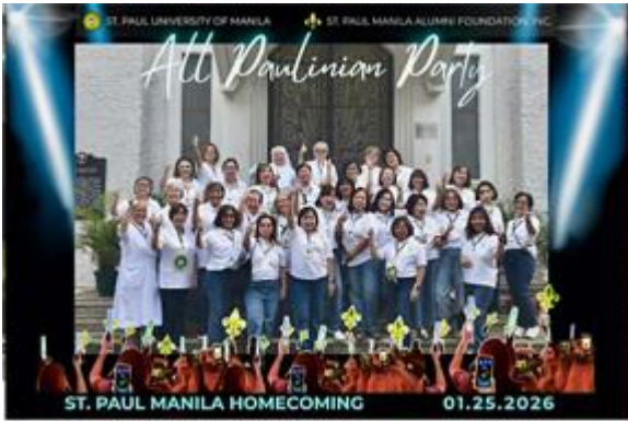
BSN 1976: Golden Jubilarians