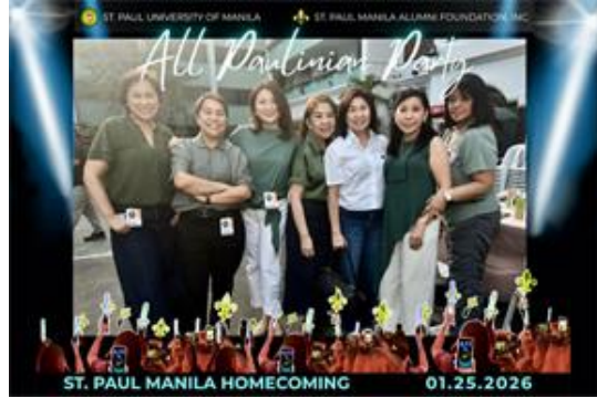
High School 1982

Dinner and program in the quadrangle followed the photoshoot.