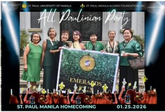
BSN 1971: Emerald Jubilarians