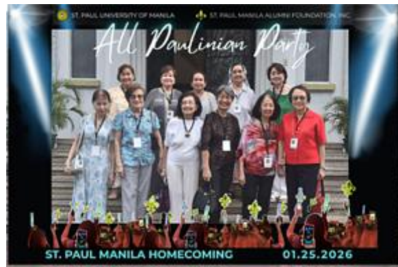
High School 1961: Platinum Jubilarian