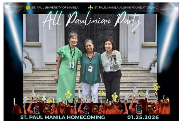
High School 1971: Emerald Jubilarian