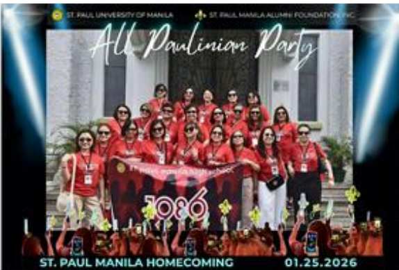
High School 1986: Ruby Jubilarians