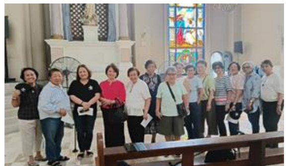
March 21, 2026 Visita Iglesia