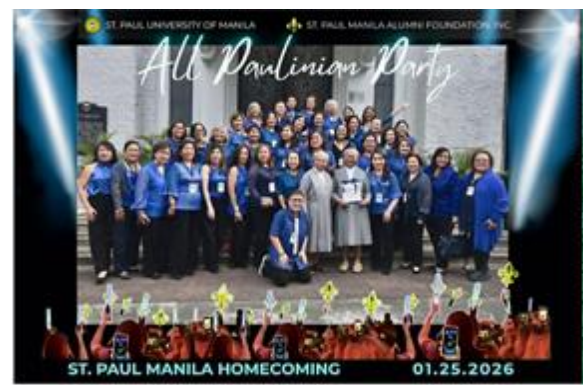
High School 1981: Sapphire Jubilarians