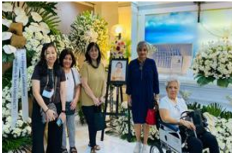
Wake of Alice Balangue