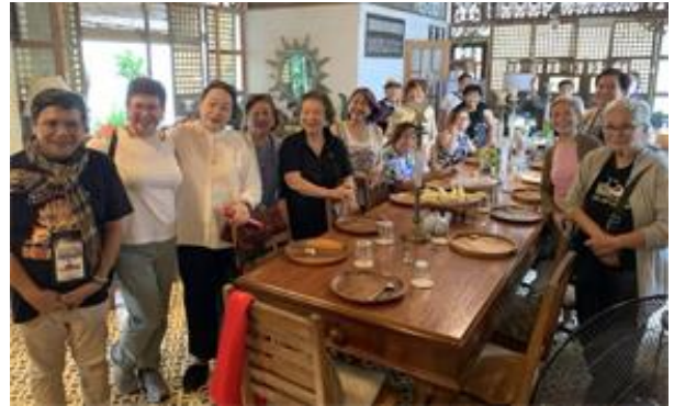
Post Homecoming Trip to Iloilo and Roxas