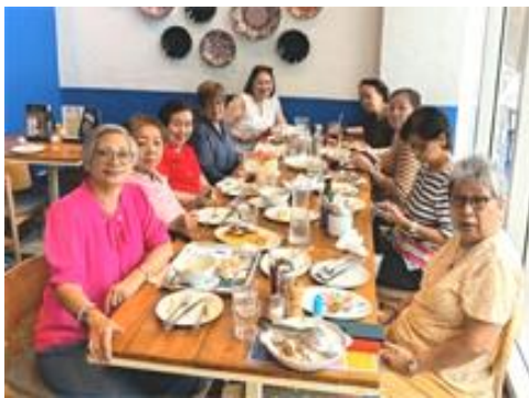
January 14, 2026 Birthday lunch for MOM