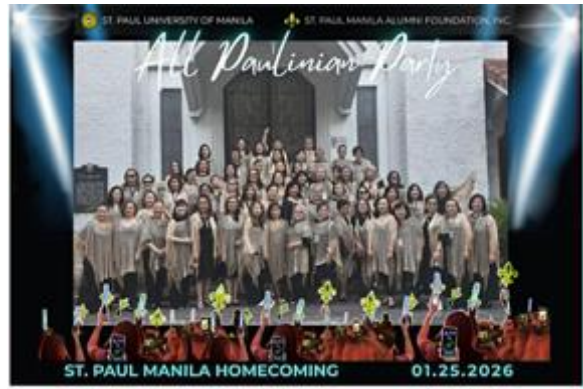
High School 1976: Golden Jubilarians