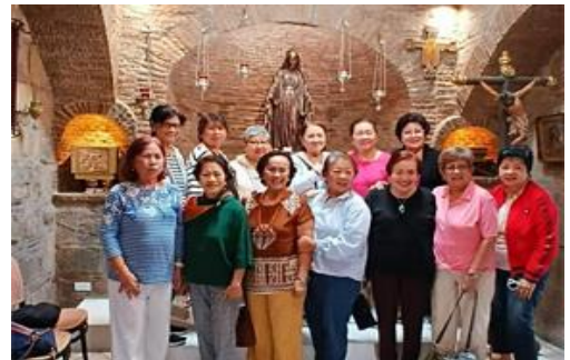
Visit to Ephesus House