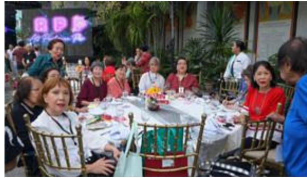
High School 1962